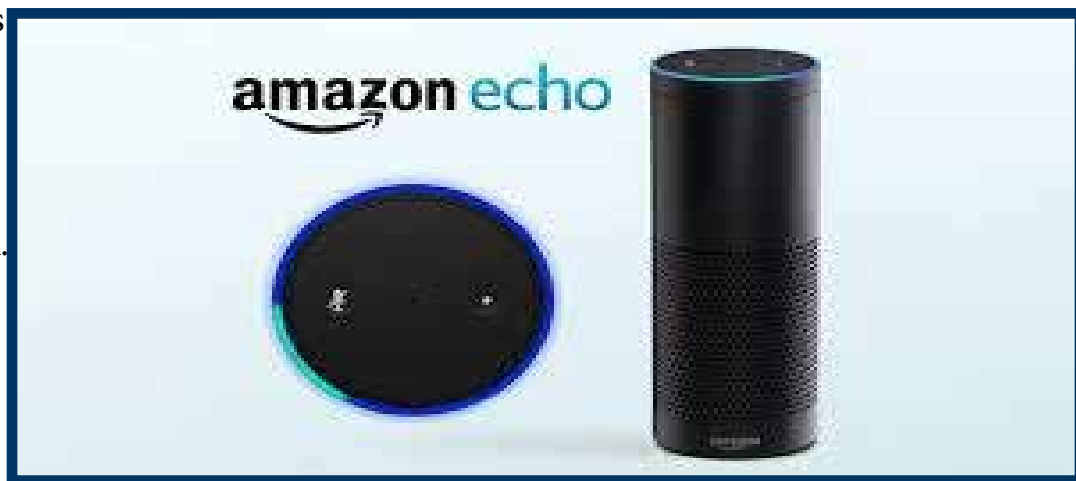
Echo dot in comparison to the Echo Tower

The Echo Dot has all the similar features as the original but in a more compact size with an appearance similar to that of a hockey puck. This compact device mimics the top of the original speaker and gives users the option of having Alexa intelligence found in the original Echo tower without having to buy the speaker.