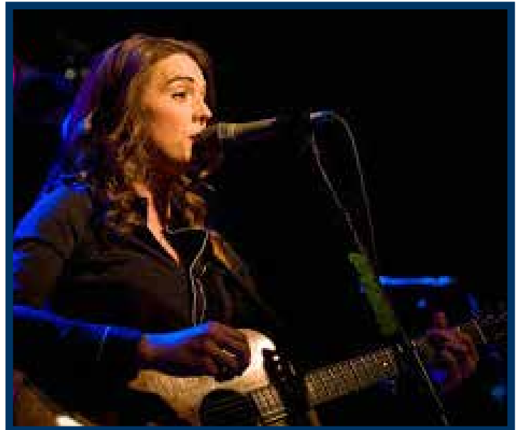
Brandi Carlile on stage performing in Seattle 2010

Amazon Prime users also have access to a wide range of books in every category or genre. In the past year, a few have been named best sellers and have become popular among Prime users and Kindle owners alike. Paula Hawkins's Girl on the Train is one thriller that beat out all others in its category for popularity. Go Set a Watchman by well-known novel writer Harper Lee was one of the most anticipated releases all year. While the book itself received mixed reviews from those who purchased a physical copy or downloaded it to their Kindle, the novel did place 6th on Amazon's book bestsellers of 2015. The popularity of the Kindle e-reader has led to a growth in book purchases for Prime users.